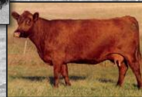
Belle 8029 -- Great granddam of Lots 84 and 152. The herd matriarch-- at 21 years of age. Her MPPA on 17 calves is 103. She has a great udder and flawless feet. Embryos available.