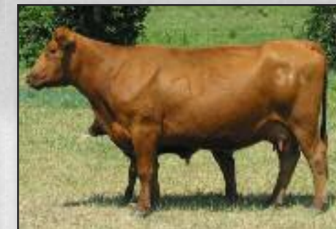
Opal 3394 -- Dam of Lot 101. A larger-framed cow, this Red Option/Make My Day cow has a great udder and brings in a whopper of a calf each year.