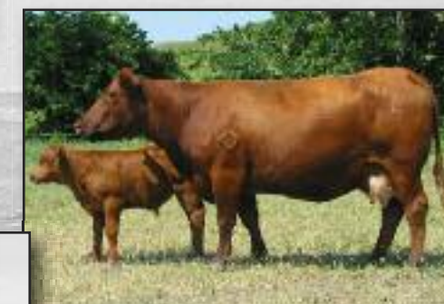
Gypsy 044 -- Dam of Lot 16. An easy-keeper, 044 is moderate, functional and easily sustainable.