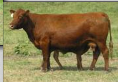
Roseanne 029 -- Dam of Lot 9. A gorgeous testament to her pedigree. We lost 029 to lightning this summer, but not before realizing her greatness.