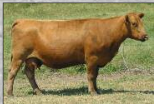
Samie 3331 --Dam of Lot 5. This high production female puts it all together... along with a 105.5 MPPA.