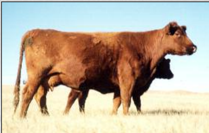
Robin 4135 -- Dam of Lots 57, 60, 64, 66, 68 & 69. This legendary cow makes sustained performance look easy. She's gentle, fertile, sound and beautiful. MPPA on 14 calves- 102. Embryos available.

The foundation of our breeding program has been impeccable fertility, sound udders, quiet dispositions and overall structural integrity... these cows aren't delicate flowers-- they're bold herd movers!