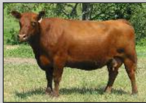
Gypsy 7086 -- Granddam of Lots 53. Small framed, low input and easy-keeping. She's the pattern for the future. Embryos available.