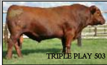
TRIPLE PLAY 503