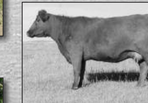
Constance 2037 -- Granddam of Lot 84. A bold example of the feminine, yet powerful influence of 8029 on the Cross Diamond herd.