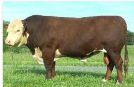
JMS VICTOR 218 343