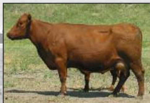
Big Girl II 933 -- Dam of Lot 55. A broody cow with a lot of depth and mass. Her MPPA on 6 calves is 103.