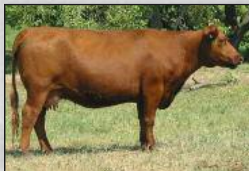
Sandcherry 125 -- Dam of Lot 41. Small, but mighty! She has a 102.5 MPPA on 6 calves.