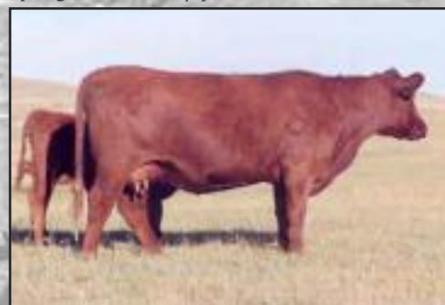
Nina 2122 -- Dam of Lot 95 and herd bull Romeo 478. She's a low maintenance 737 daughter who quietly goes about her business of keeping us in business.