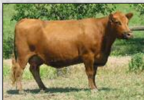
Sunny 001 -- Dam of Lot 85. High mass cow. She's solid in looks and production.