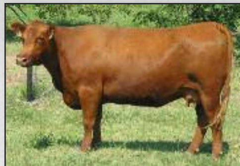
Georgia 215 -- Dam Lot 20. A great producer--MPPA of 104.2. 4001, at right is a daughter.