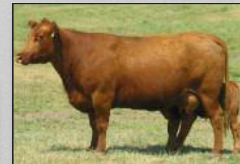
Constance 290 -- Dam of Lot 92. There's power in this atlas-bred cow! She always brings in a calf made for performance.