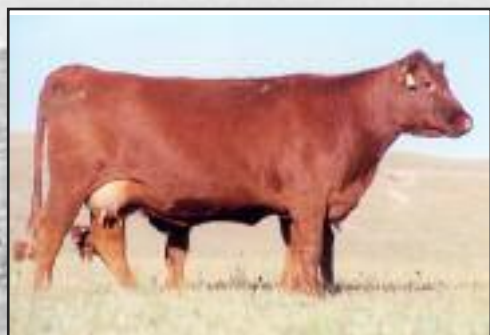
Robin 721 -- Dam of Lot 149. 721 has been a quiet powerhouse in the herd, consistently producing offspring as structurally perfect as she is.