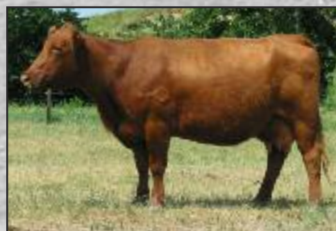
Grand Lady 1655 -- Granddam of Lot 2. A deep, angular cow with a great production record: 108 MPPA.