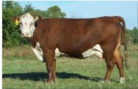
JMS VICTORIA 001 303, dam of Lot 164